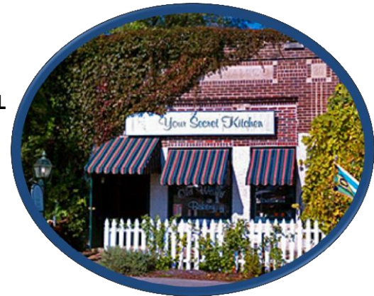
YOUR SECRET KITCHEN, SUAMICO, WI