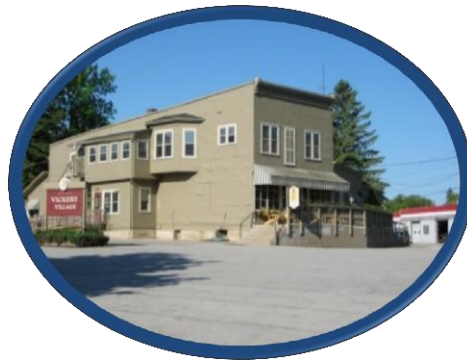
CHIVES RESTAURANT, SUAMICO, WI