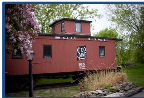
500 CABOOSE, SUAMICO, WI