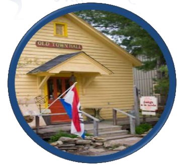
DESIGN A LA MODE IN OLD SUAMICO TOWN HALL, SUAMICO, WI

The Town Center has for generations been the “Heart” of Suamico and with redevelopment plans underway it is quickly becoming the place to be for residents and businesses alike. As one of the earliest sites of settlement, this area represents the character of our community through its proximity to the Suamico River and the various historic buildings featured throughout. What began as one citizen’s endeavor to protect Suamico’s heritage has become a full fledged community redevelopment effort. The area features multiple building lots for new businesses and with further development scheduled over the next five years, the town center is the perfect location for starting businesses. People come from all around to visit, explore and shop in our community’s center.